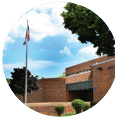
North Division High School