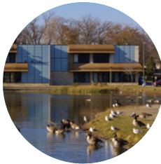
Kosciuszko Community Center