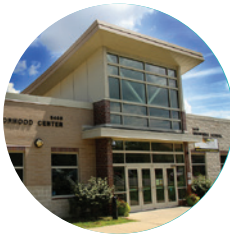
Silver Spring Neighborhood Center