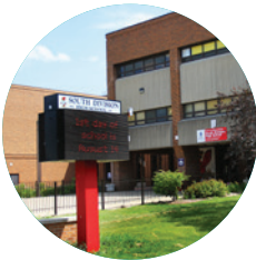
South Division High School