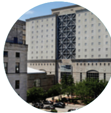
Milwaukee County Jail