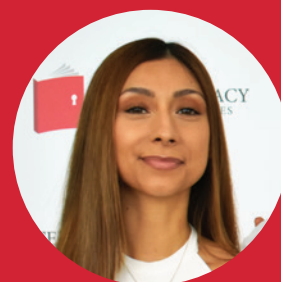
2022 HSED Graduate & MATC Scholarship Awardee