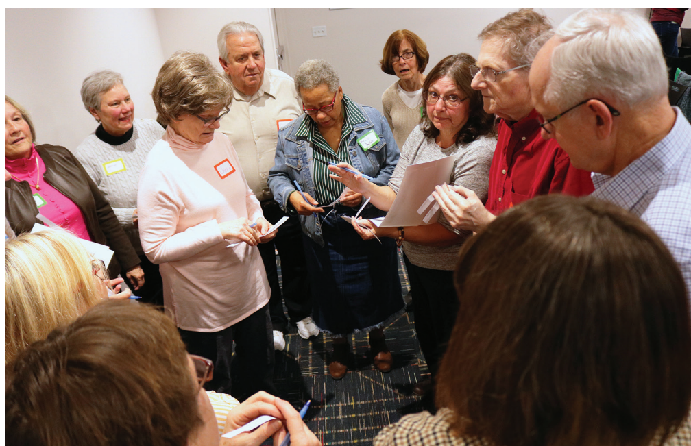
Volunteers engaged in solving a mystery through active listening, ensuring all voices are heard and collaborating to make an informed decision in solving the crime!