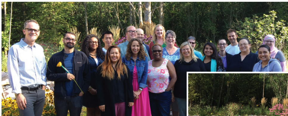
Meet the whole staff!! On August 23 and 24, the “new” team met for a much needed retreat at the gorgeous Prairie Springs Environmental Education Center. Learn more about the people and programs that are offered at the “new” LSW on page 3.

It has been quite a whirlwind here at the “new” Literacy Services of Wisconsin since our last newsletter. I said “new” because since we last wrote you in April, Literacy Services has merged with Milwaukee Achiever Literacy Services. I said “new” because as of August 17, our board of directors has approved our strategic plan for the next three years. I said “new” because we have added six new leaders to our board of directors this year. I hope you have been tracking our progress through our website, stories in the news, and a special mailing earlier this summer, but if you haven’t this newsletter will catch you up. The Syllabus is typically printed in black and white to conserve your financial contributions. I thought that for a minimal increase in printing cost you can better “meet” our new team and see our new locations. This issue of the Syllabus is dedicated to the merger with Milwaukee Achiever Literacy Services and our new strategic plan. With so much going on here it has taken us a little